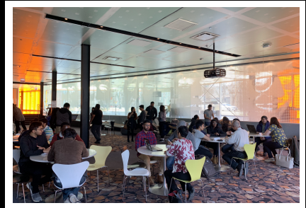
Faculty Speed Mentoring, 3/26/19