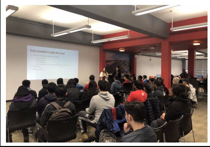
Info Session, 2/27/19