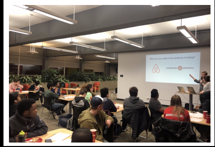
Design Thinking Workshop, 3/7/19