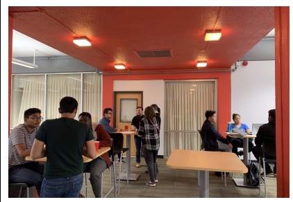
Ethics and Inclusivity Workshop, Hosted by IIT Speech & Debate and PRISM, 3/28/19